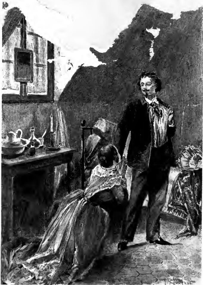
CLAUDINE IN LA PALFERINE'S ATTIC ( A Prince of Bohemia. )